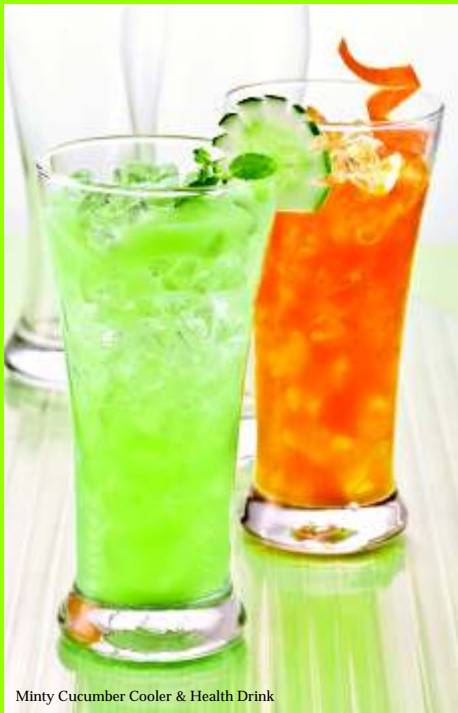
Minty Cucumber Cooler & Health Drink

S wimming headlong into the world of dieting without arming themselves with the right information, people often end up going overboard with their weight-loss measures. They strictly avoid their favourite dishes, go on crash diets, and end up spoiling their health and appetite in the long run!